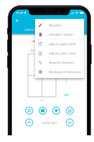
Adjust limits, reverse direction and access to OTA update for your blinds