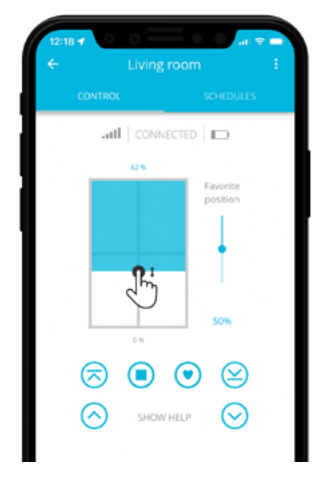
Swipe to set the blind to any desired position