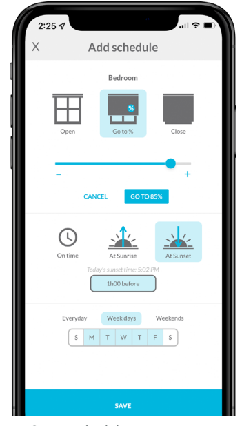
Create schedules to your rooms adapted to your routine

Features will vary based on the motor brand and blind type. The percentage position<sup>3</sup> is only available for certain motor brands.