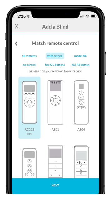
Vast compatibility with many different motor brands